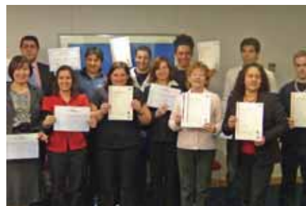
Staff and managers receiving their certificates

Over 200 staff and an impressive 20% of the workforce has now achieved a formal certification and staff are actively encouraged to gain fresh qualifications to help in their career and personal growth – a real accomplishment and congratulations go to them all.